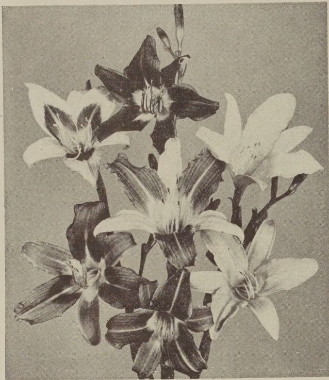
MODERN HYBRID DAYLILIES